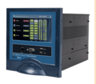
G5DFR Multi-functional recorder