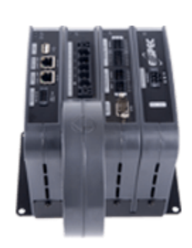
G4400 permanently installed power quality analyzer