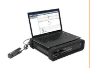
G4500 Portable power quality analyzer