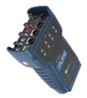
PureBB Hand-held power quality analyzer